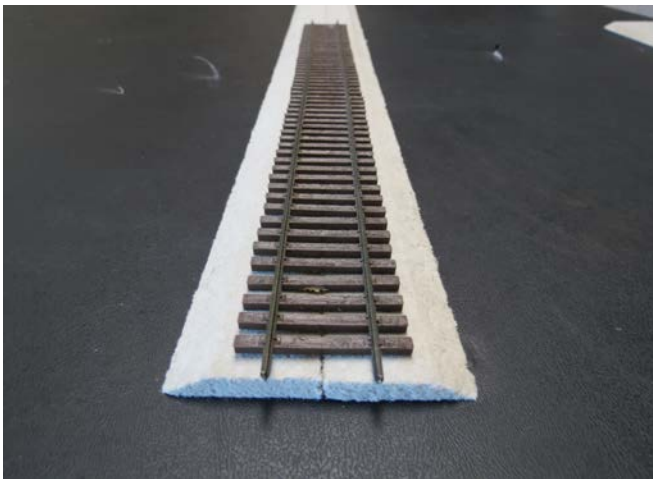
Straight and curvable mainline roadbed

Tomalco Track is back in the roadbed business after finding a new supplier. The roadbed is beveled at 30 degrees, giving it a more prototypical look than the usual 45 degrees other roadbeds come in. This homasote product is excellent at sound deadening and holds spikes and track nails. It can be glued down with yellow carpenters glue. Once installed, it should be painted with a latex paint to seal it from absorbing moisture.